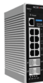
NX-IES802DC POE - NX-IES402 POE